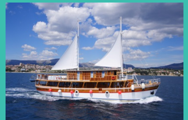
A category MV LOPAR, or similar