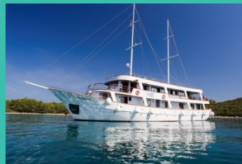
A+ category MV DALMATIA, MV VAPOR, or similar